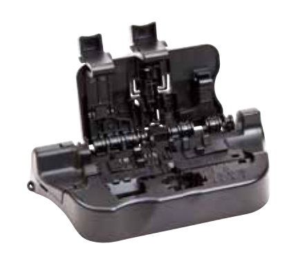
3M™ Easy Cleaver