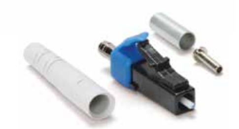
3M™ Hot Melt LC Connector