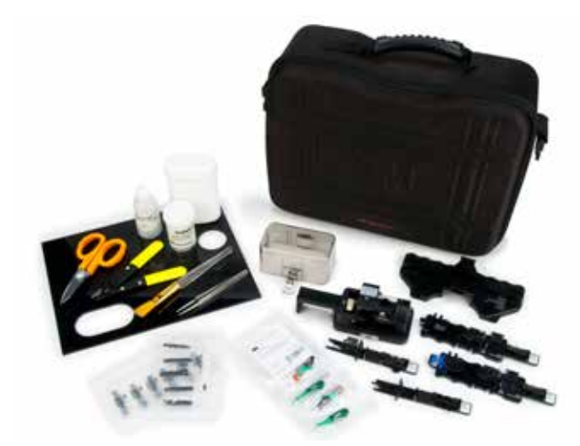
3M™ Fiber Optic Angle Cleave Kit 2565

3M<sup>™</sup> No Polish Connector Kits provide the tools and materials needed to terminate singlemode and multimode SC and LC flat splice no polish connectors. The 3M<sup>™</sup> No Polish Connector Premium Kit with Cleaver 8865-C/PR has the tools of the regular 8865-C kit, but in a larger case with a work surface, fiber shard container, tweezers, brush and lint-free wipes in a tub. The 3M<sup>™</sup> Fiber Optic Angle Cleave Kit 2565 provides the tools necessary to terminate 3M<sup>™</sup> No Polish LC/APC and SC/APC Angle Splice Connectors. The 3M<sup>™</sup> Fibrlok<sup>™</sup> Angle Splice Assembly Tool 2501-AS is also included to terminate 3M<sup>™</sup> Fibrlok<sup>™</sup> Angle Splices. Replacement parts are available.