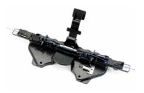
3M™ Fibrlok™ Angle Splice Assembly Tool 2501-AS