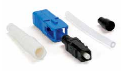
3M<sup>™</sup>Epoxy SC Connector

3M Epoxy Connectors feature a pre-radiused, zirconia ceramic PC ferrule designed to provide contact of fibers for low reflection and low insertion loss. The 3M epoxy SC and FC connectors are intermateable within NTT specifications. Singlemode epoxy connectors are tested to Telcordia GR-326-CORE. These connectors are built to exacting ferrule length tolerances for maximum machine polish yield and bulk packaged to maximize factory cable assembly efficiency. 3M Epoxy Connectors can also be used with an anaerobic adhesive for fast-cure interconnect applications.