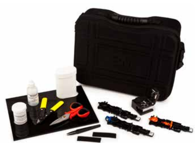
3M™ No Polish Connector Premium Kit with Cleaver 8865-C/PR