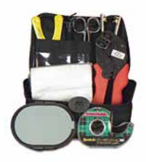
3M<sup>™</sup> Crimplok<sup>™</sup> Kit 6955 (components loaded in pouch)