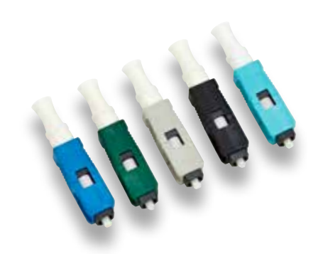
3M<sup>™</sup> Crimplok<sup>™</sup>+ Connector Family

The Crimplok+ Connectors and Tools are RoHS compliant.*