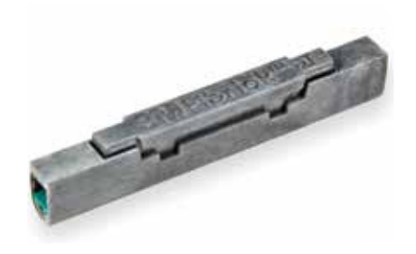
3M<sup>™</sup> Fibrlok<sup>™</sup> II Angle Fiber Splice 2529-AS

The 2540G splice helps enable fast, easy splicing of 250 µm singlemode and multimode fiber for most splice installations, including fiber-to-the-premises. Using the small, rugged 3M<sup>™</sup> Fibrlok<sup>™</sup> Assembly Tool 2504G, it can be installed in almost any environment, whether it is an aerial application or inside a building.