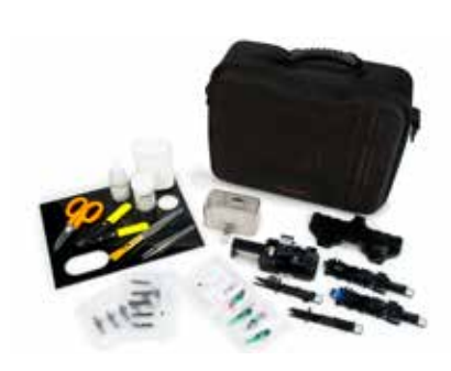
3M<sup>™</sup> Fiber Optic Angle Cleaver Kit 2565 includes 3M<sup>™</sup> Fiber Optic Angle Cleaver 2535, 3M<sup>™</sup> Fibrlok<sup>™</sup> Angle Splice Assembly Tool 2501-AS and all tools necessary for 3M<sup>™</sup> Fibrlok<sup>™</sup> Angle Splices.