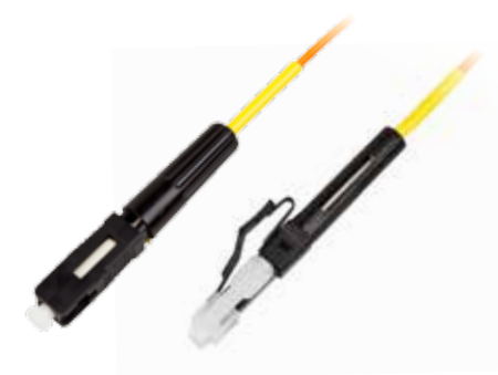
3M™ No Polish SC (left) and LC Connector for Jacketed Cable