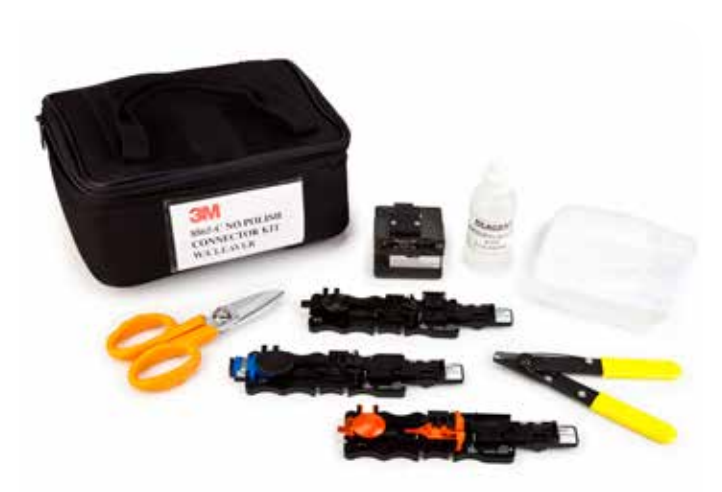
3\mbox{M}^{\mbox{\tiny TM}} No Polish Connector Kit 8865\mbox{-C}