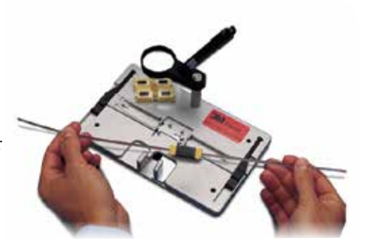
3M™ Fibrlok™ Multi-Fiber Optical Splicing System 2600

The 2600 splice uses the same field-proven Fibrlok splice technology to provide fast, efficient and permanent splicing of multiple optical fibers. The Fibrlok multifiber splicing system consists of a consumable splice "module" and associated fiber preparation and splicing tools. Splices are available in 4-, 8-, and 12-fiber versions, for both fiber optic ribbon and "ribbonized" fibers, and can be assembled in less than five minutes. This makes the Fibrlok multi-fiber splice ideal for both new construction and cable restoration applications.