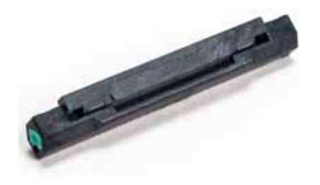
3M™ Fibrlok™ 250 \mu m Angle Fiber Splice 2540-AS

The 2529-AS splice was designed for the splicing of combinations of 250 \mu m and 900 \mu m fibers. The Fibrlok angle splices help enable fast, on-site installation of fiber with <-60 dB optical reflection across temperature extremes for excellent analog video transmission performance.