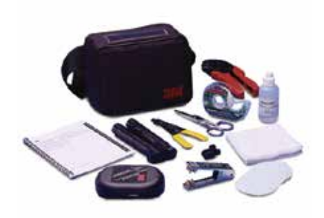
3M™ Crimplok™ Kit 6955(components displayed)

The Crimplok Termination Kit and accessories provide the tools and materials necessary to terminate 3M™ Crimplok™ Fiber Optic Connectors. Replacement parts are available.