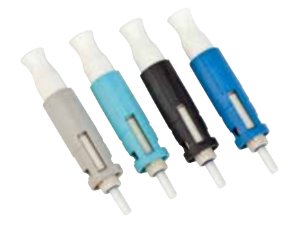
3M™ No Polish ST Connector Family