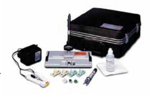
3M™ Fibrlok™ Multi-Fiber Splice Preparation Kit 2600

The 2600 splice preparation kit provides the components required to assemble the multi-fiber splice. The 3M^{\tiny{\text{IM}}} Fibrlok<sup> ^{\text{IM}} </sup> Ribbon Construction Tool 2670 provides organization and "ribbonizing" of individual 250 \mu m coated fibers prior to splicing. The Fibrlok tooling is designed to minimize the required tooling investment.