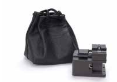
3M™ Cleaver 2534