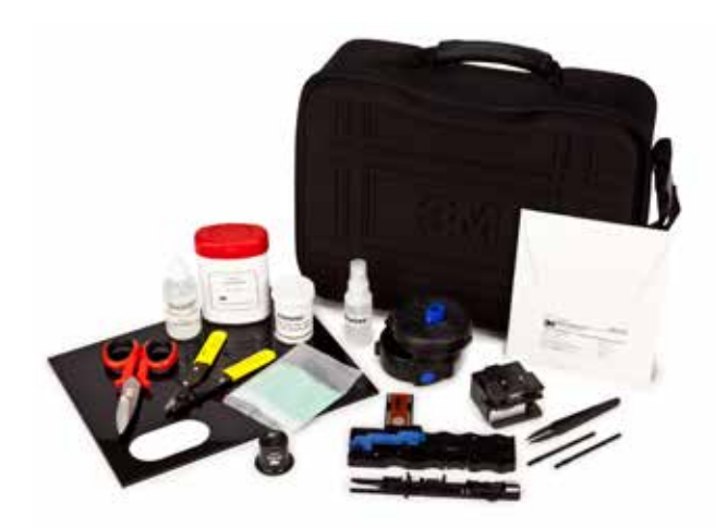
3M^{^{1\!\!1}} Crimplok ^{^{\!\!1\!\!1}}+ SC/UPC Connector Kit 8765-UPC for 3M^{^{1\!\!1}} Cripmlok ^{^{\!\!1\!\!1}}+ Connectors 8700-UPC and 6700 Series

3M^{\text{TM}} Crimplok ^{\text{TM}} + Connector Kits 8765-UPC/8765-APC provide the tools needed to terminate 3M Crimplok+ Connectors 8700-UPC 6700 and 8700-APC series, respectively. Both kits contain the same fiber preparation tools including a high quality cleaver, a work surface and a case with an integrated hook for easy hanging. Each kit contains a specific 3M^{\text{TM}} Crimplok ^{\text{TM}} + Protustion Setting Tool and 3M^{\text{TM}} Crimplok ^{\text{TM}} + Nano Finishing Tool, depending upon the connector type. UPC tools provide a square finish while APC tools provide a 8° angled finish.