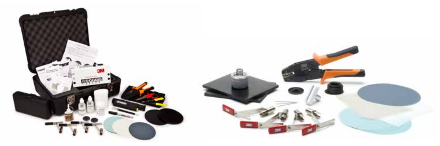
3M™ Hot Melt Termination Kits 6366 and 6362-230V

3M^{\text{\tiny IM}} Hot Melt Termination Kits 6366 (120V oven) and 6362 (230V oven) contain the tools and materials necessary to terminate 3M^{\text{\tiny IM}} Hot Melt SC, ST, and FC Connectors, both singlemode and multimode. The 3M^{\text{\tiny IM}} LC Hot Melt Expansion Kit 6650-LC is used in addition to the 6366/6362 hot melt termination kits to terminate 3M^{\text{\tiny IM}} Hot Melt LC Connectors.