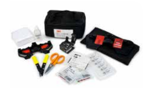
3M™ Fibrlok™ Splice Kit with Cleaver 2559-C