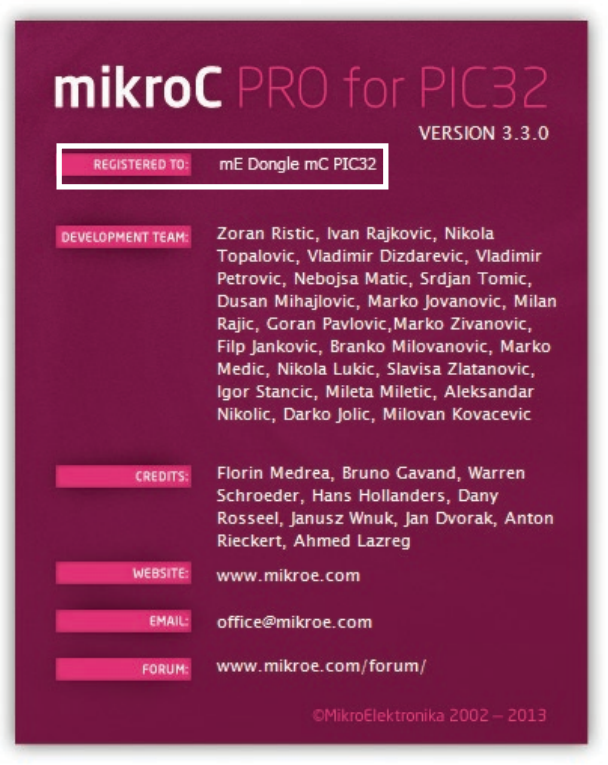
Figure 1-2: mikroC PRO for PIC32® About Window