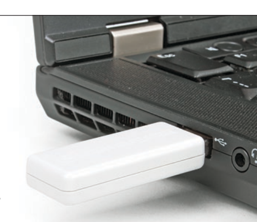
Figure 1-3: USB Dongle plugged into Laptop USB host connector

Yes. If you already have USB Dongle Licenses for other MikroElektronika software products, you can use them simoutaneously on a single computer. If your computer doesn't have enough USB host ports, you can use additional USB hub.