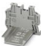
Quick mounting end clamp for NS 35/7,5 DIN rail or NS 35/15 DIN rail, can be fitted with ZB 5 and ZBF 5 zack marker strip, KLM 2, KLM3, and KML3L terminal strip marker, parking option for FBS...5, FBS...6, KSS 5, KSS 6, width: 5.15 mm, color: gray