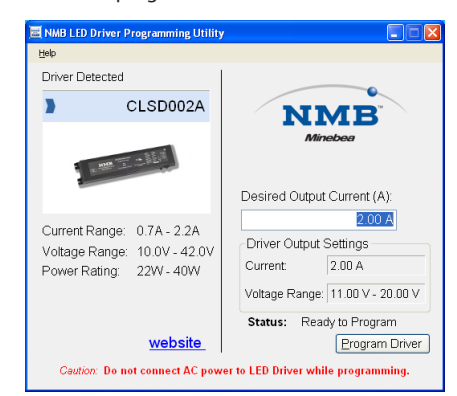
Additional driver modules can be programmed by repeating the process with a new driver.

Your desired output current will now match your driver output settings. Your CLSD Driver is now programmed.