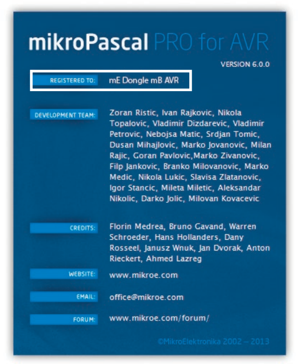
Figure 1-2: mikroPascal PRO for AVR® About Window