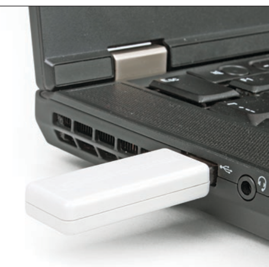
Figure 1-3: USB Dongle plugged into Laptop USB host connector

Yes. If you already have USB Dongle Licenses for other MikroElektronika software products, you can use them simoutaneously on a single computer. If your computer doesn't have enough USB host ports, you can use additional USB hub.