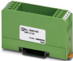
Custom circuit module, consisting of housing, MKDS 3 connection terminal blocks and PCB

Please be informed that the data shown in this PDF Document is generated from our Online Catalog. Please find the complete data in the user's documentation. Our General Terms of Use for Downloads are valid ( http://download.phoenixcontact.com )