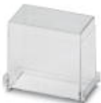
Covering hood, for the contact and dust-protected encapsulation of the components, in transparent design. Height: 35 mm, width: 22.5 mm

Electronic housing - EMG 22-H 52MM GN - 2946175