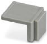
Equipment marker, narrow

Marking material - EMG-SGKS 10 - 2947585