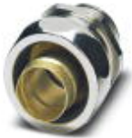
Cable gland made from brass with Pg thread, IP65 protection

Screw connection - WP-G BRASS IP65 PG29 - 3241056