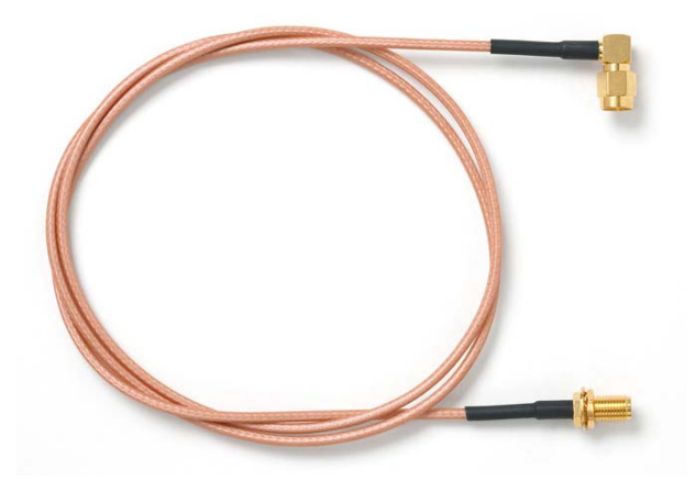
Model 73071-X SMA Right-Angle Plug to SMA Bulkhead Jack, RG142B/U