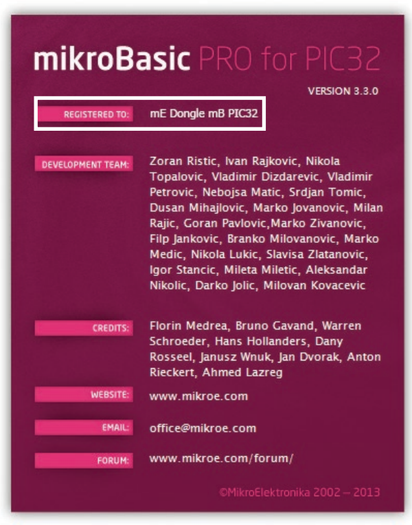
Figure 1-2: mikroBasic PRO for PIC32® About Window