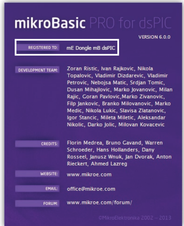
Figure 1-2: mikroBasic PRO for dsPIC® About Window