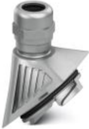
EVO metal cable gland with bayonet locking, B series, size M20, cable diameter: 7 - 13 mm

Please be informed that the data shown in this PDF Document is generated from our Online Catalog. Please find the complete data in the user's documentation. Our General Terms of Use for Downloads are valid ( http://phoenixcontact.com/download )