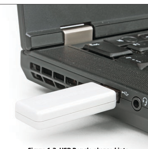
Figure 1-3: USB Dongle plugged into Laptop USB host connector

Yes. If you already have USB Dongle Licenses for other MikroElektronika software products, you can use them simoutaneously on a single computer. If your computer doesn't have enough USB host ports, you can use additional USB hub.