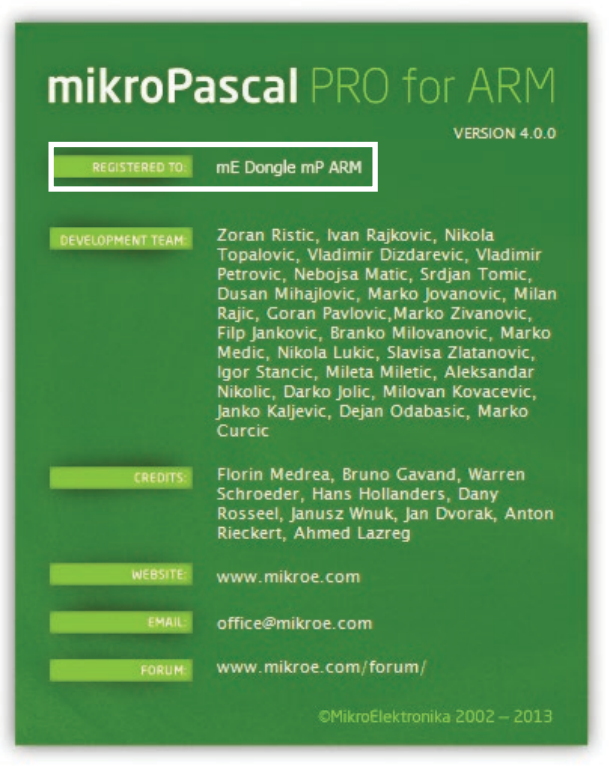
Figure 1-2: mikroPascal PRO for ARM® About Window