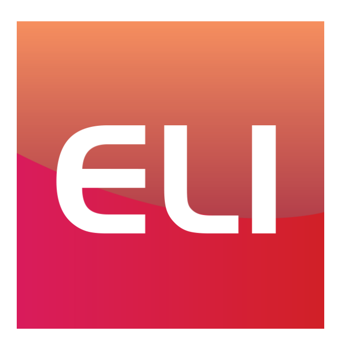
Easy LCD Interface