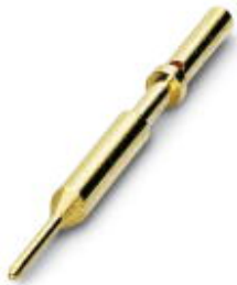
Crimp contact, turned, Contact diameter: 0.6 mm, Crimp range: 0.08 mm 2 ...0.25 mm 2

Please be informed that the data shown in this PDF Document is generated from our Online Catalog. Please find the complete data in the user's documentation. Our General Terms of Use for Downloads are valid ( http://download.phoenixcontact.com )