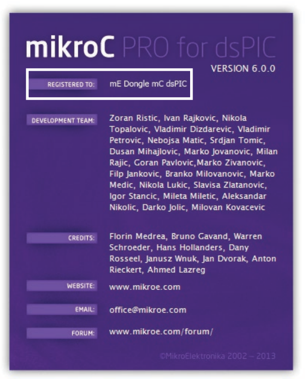
Figure 1-2: mikroC PRO for dsPIC® About Window