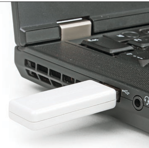
Figure 1-3: USB Dongle plugged into Laptop USB host connector

Yes. If you already have USB Dongle Licenses for other MikroElektronika software products, you can use them simoutaneously on a single computer. If your computer doesn't have enough USB host ports, you can use additional USB hub.