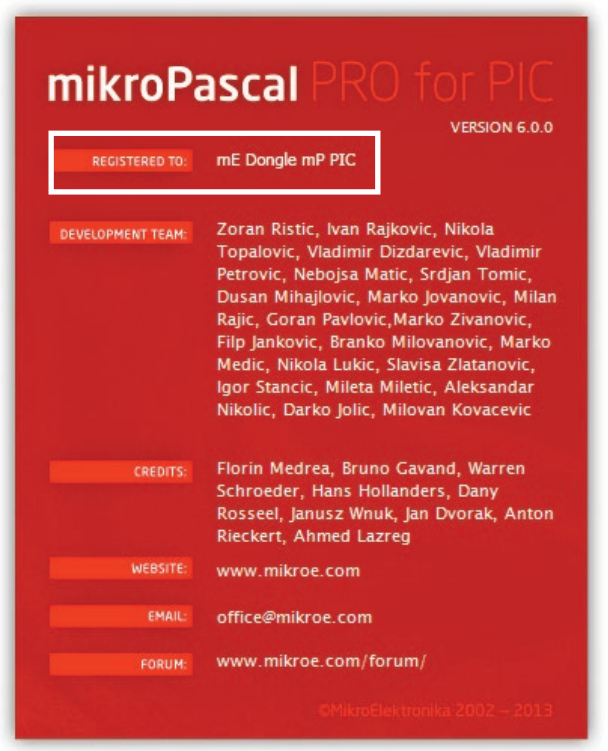
Figure 1-2: mikroPascal PRO for PIC® About Window