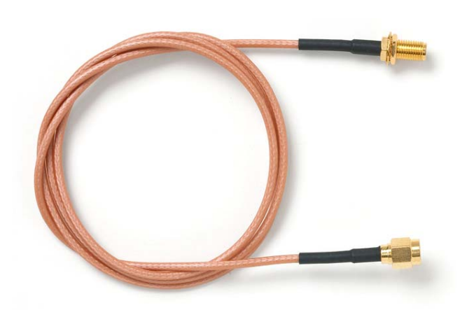
Model 73070-BB SMA Plug to SMA Bulkhead Jack, RG316/U