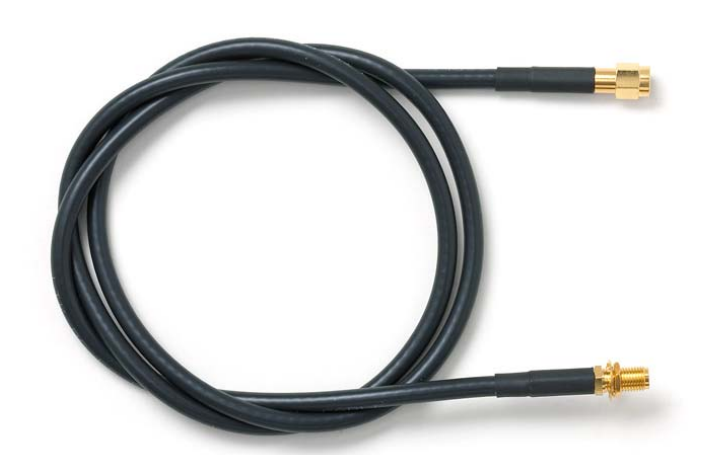
Model 73070-C SMA Plug to SMA Bulkhead Jack, RG58C/U

SMA Plug to SMA Bulkhead Jack, RG316/U, RG58C/U