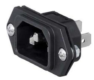
6100 with sealing to appliance