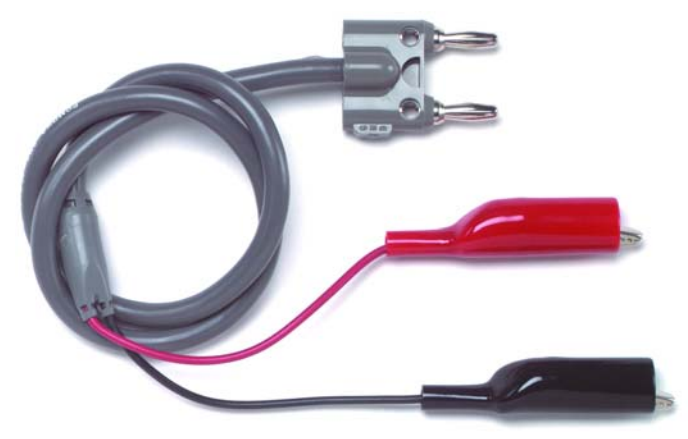
Model 2BA-AL Double Banana Plug to Alligator Clip Breakouts Cable Assembly

(Model 2BC-AL: Double Banana Plug, Cable, and Molded Breakout is in Black)