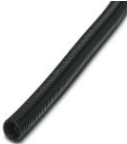
Polyamide protective hose, inflammability class HB, UV resistant

Please be informed that the data shown in this PDF Document is generated from our Online Catalog. Please find the complete data in the user's documentation. Our General Terms of Use for Downloads are valid ( http://phoenixcontact.com/download )