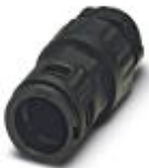
Cable gland, metric thread, IP66 protection, with strain relief

Screw connection - WP-GR HF IP66 M40 BK - 3240957