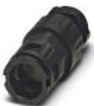
Cable gland, metric thread, IP68/69k protection, with strain relief

Screw connection - WP-GR HF IP69K M40 BK - 3240943