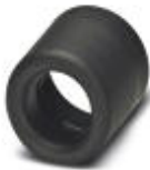
End sleeves as cable protection

Cable protection end sleeve - WP-SC PA HF 42,5 BK - 3240987