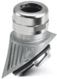
EVO metal cable gland with bayonet locking, B series, size M32, cable diameter: 14 - 21 mm

Please be informed that the data shown in this PDF Document is generated from our Online Catalog. Please find the complete data in the user's documentation. Our General Terms of Use for Downloads are valid ( http://phoenixcontact.com/download )